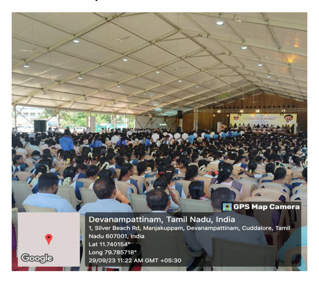
Activity: Neithal Book Festival Cuddalore silver beach-2023

Duration Date and Time: 29/09/23 and 9.30AM