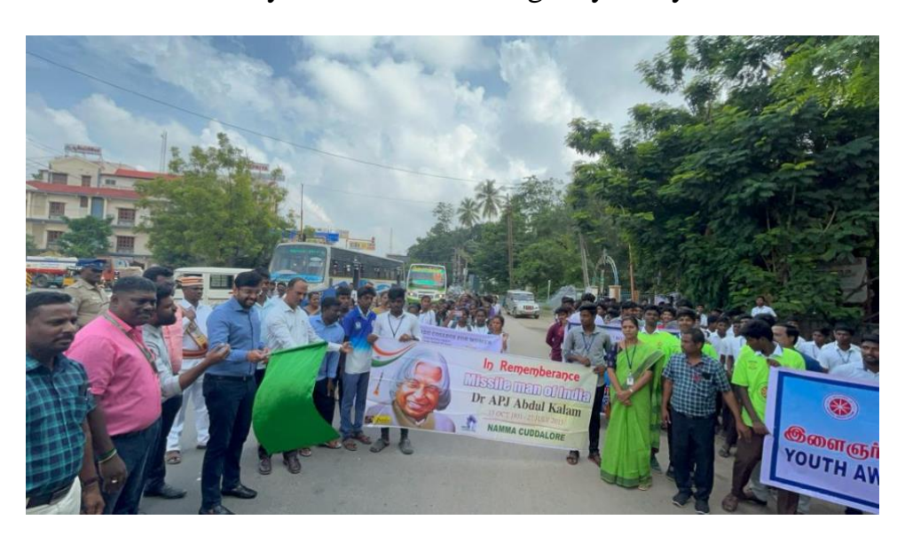
Activity: Youth Awakening Day Rally

Duration Date and Time: 16/10/23 and 9.30AM