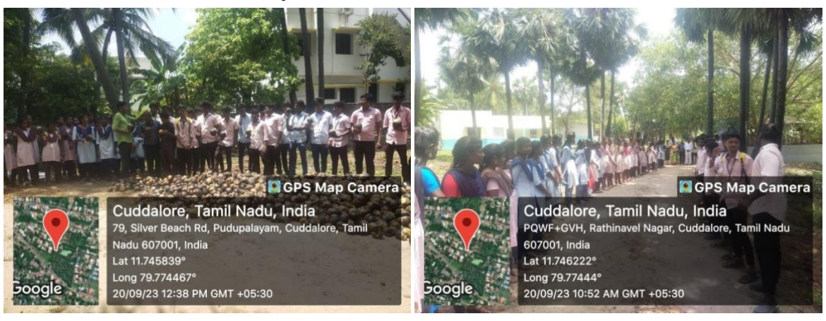
Activity: Palm Seeds selection Process

Duration Date and Time: 20/09/23 and 11.30AM