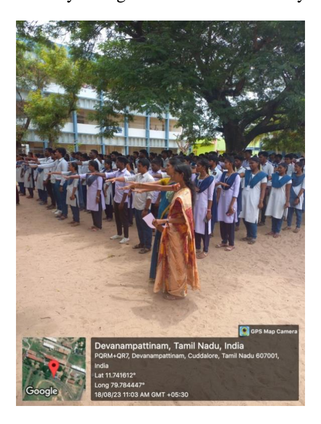
Activity: Religious Reconciliation Day

Name of the Activity: Religious Reconciliation Day