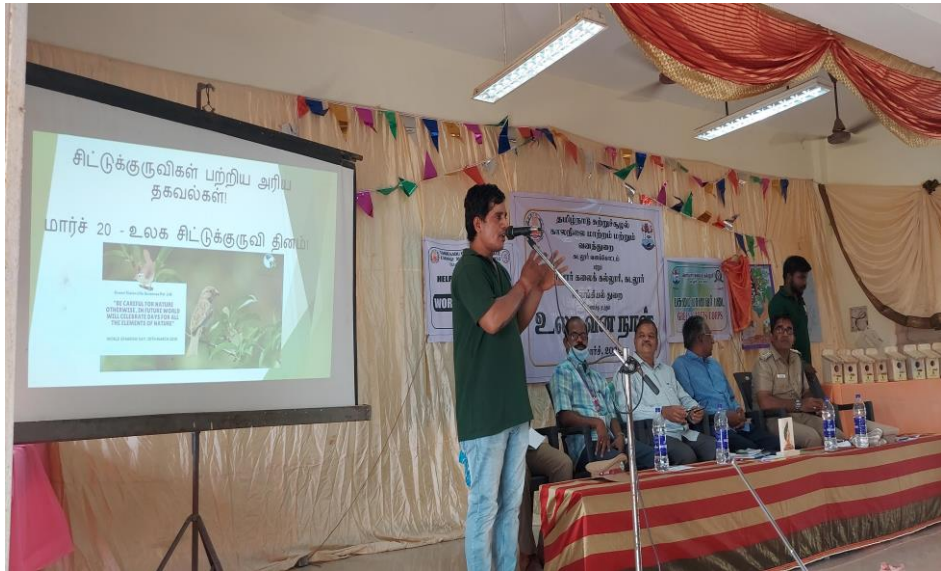
World Sparrow Day 20 th March 2022, 10.30am to 1.00pm