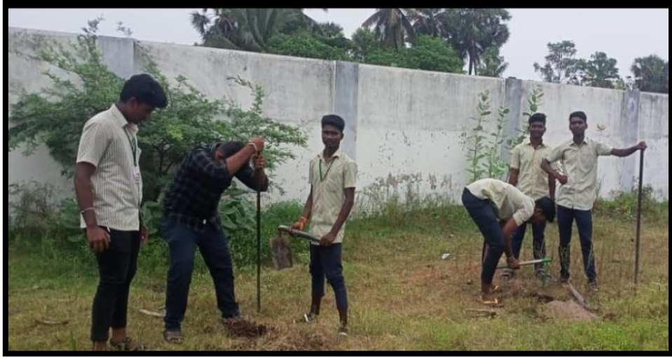
World Environment Day 5 th June 2022, 11.00am to 1.00pm